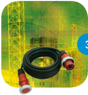
3 Connection cables/extension cables/cable reels