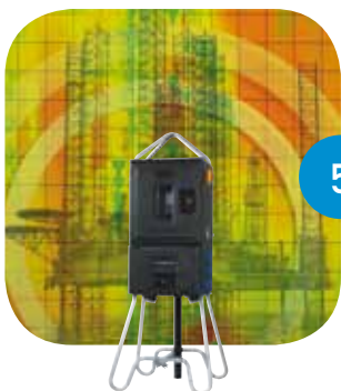
5 Distribution boxes with meter compartment