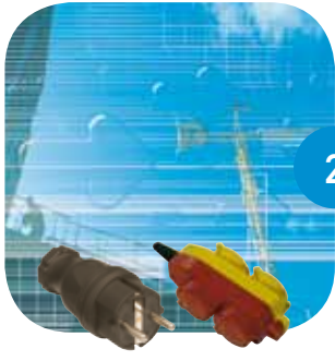
2 "Schuko" contact material