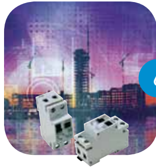
6 Circuit breakers/earth leakage switch